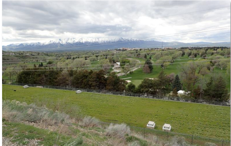
View west toward the Wellsville Range over-looking the Logan Golf & Country Club*

The inaugural CVUU hike occurred on Sunday, April 24 th under cloudy skies with the threat of rain.